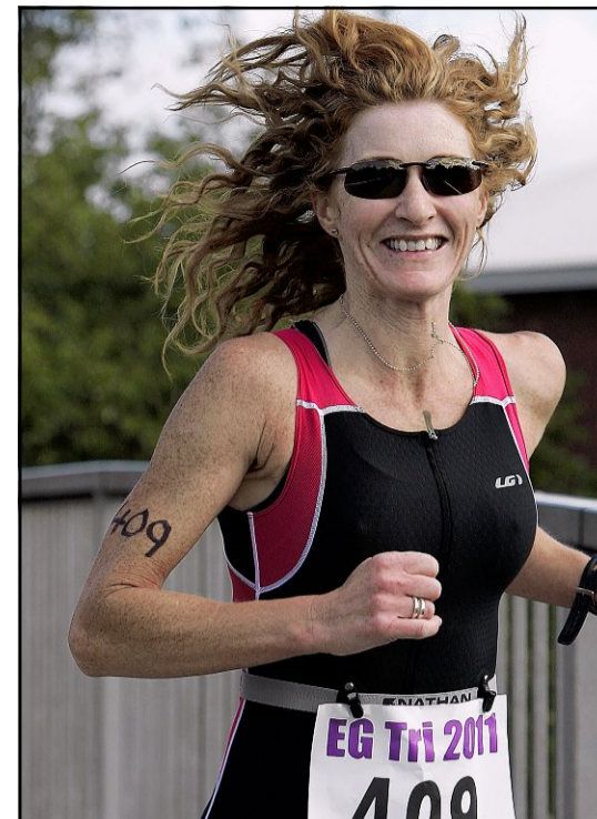
THE THREE DISCIPLINES: The EG Triathlon swim, bike and run attracted hundreds